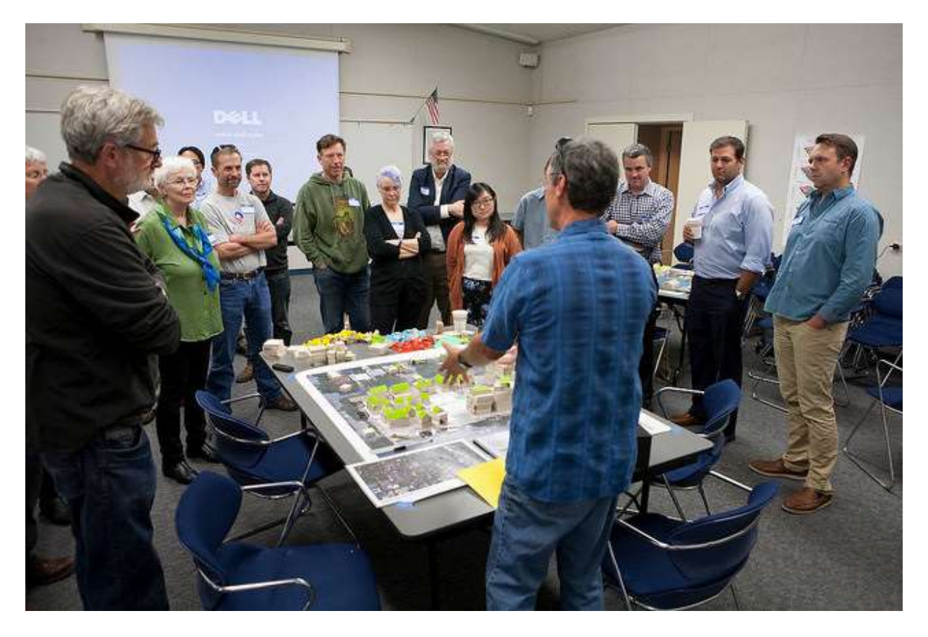
Figure 4: Participant presenting his group's built outcome.

The purpose of the workshops was not to arrive at a community consensus or a particular design, (as would be done in a charrette) but to: