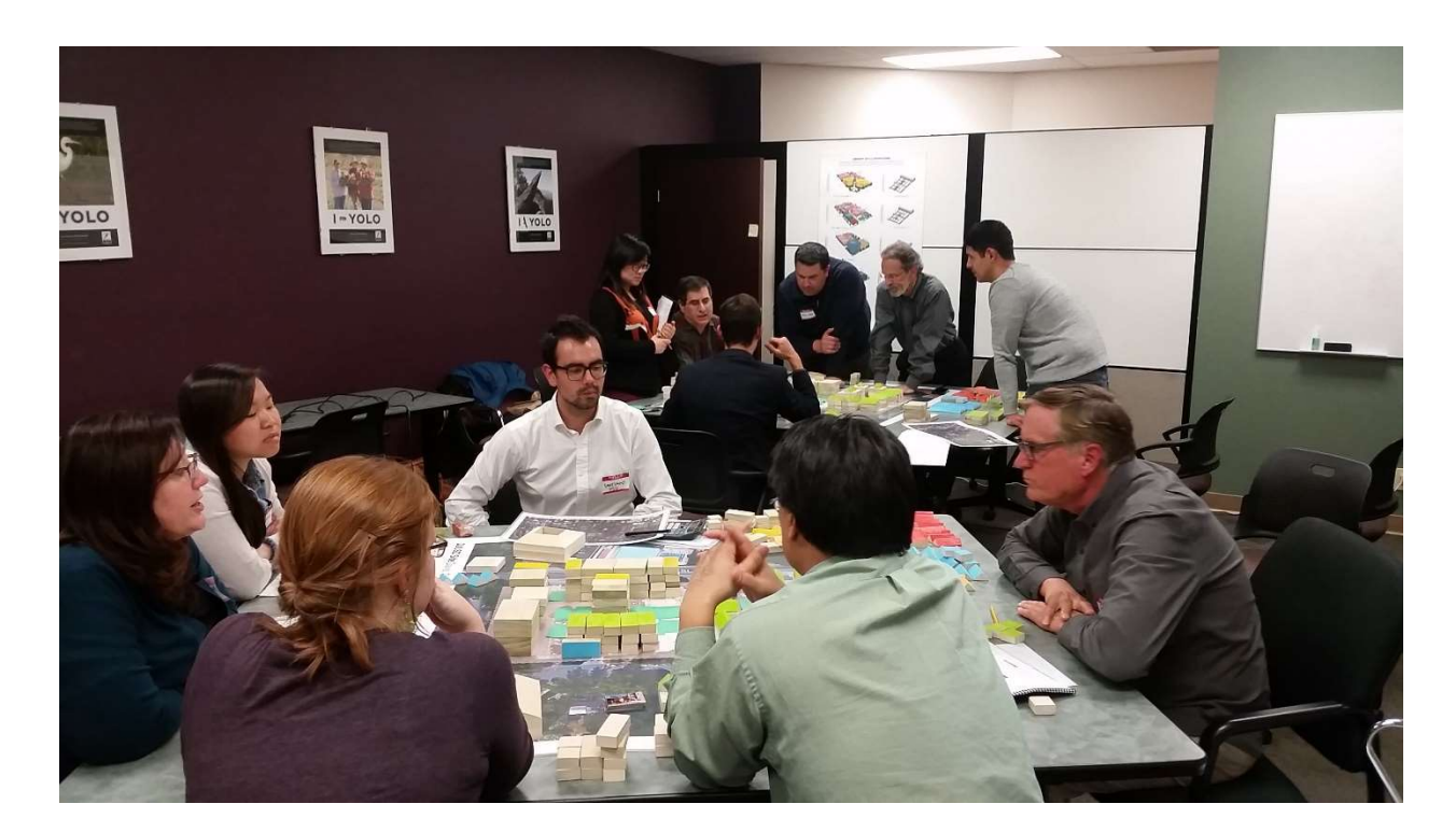
Figure 5: Test-run of the workshop with city and school district staff and a district board member.

advocates, neighborhood advocates, business owners, homeowners from a variety of neighborhoods, developers, and other professionals.