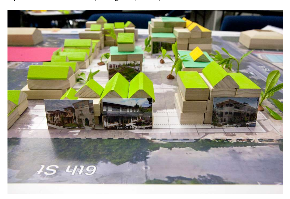
Figure 6: Street trees, green roofs and gardens were a prominent part of this group's concept.

A significant number of landscaping and green design elements featured in many of the concepts. Landscaping ideas took the form of gardens or small parks and also retention or replacement of street trees (see Figure 6, below).