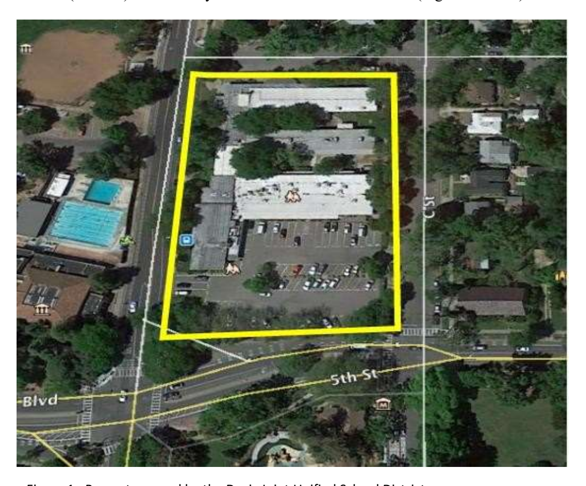
Figure 1: Property owned by the Davis Joint Unified School District.

This project was designed to help the city government and its residents address the popular fears of, and regulatory barriers to more efficient, higher density growth and development that conforms to the direction of SACOG's Blueprint Principles, and more recently to its Sustainable Communities Strategy, which addresses the intent of watershed state planning legislation, Senate Bill 375. Toward this end, we focused on a property owned by the Davis Joint Unified School District (DJUSD) immediately north of the downtown district (Figure 1 below).