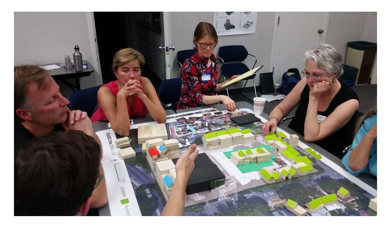
Figure 3: Table of community members at a site brainstorming workshop.

Design professionals and students, facilitators, and an expert in development economics were available to answer questions and help participants with the exercise.